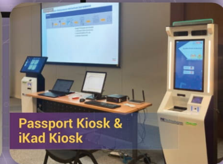
Passport Kiosk & iKad Kiosk