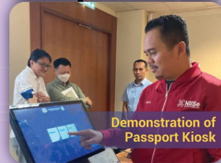
Demonstration of Passport Kiosk

Purnama Meeting Room, Level 6, Block D7, Complex D, KDN, WP Putrajaya.